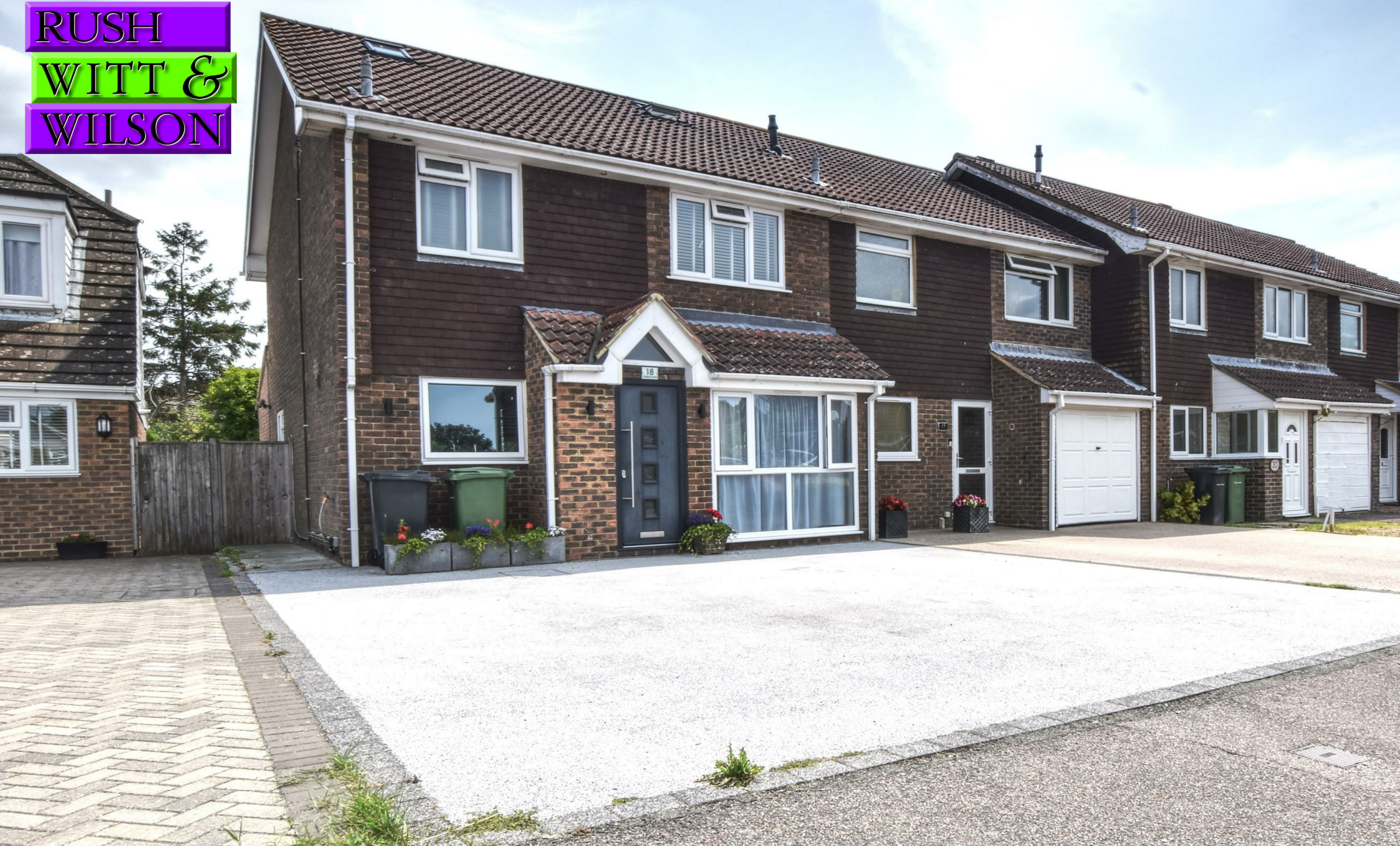
18 Glebe Close, Bexhill-On-Sea, East Sussex TN39 3UY £429,000